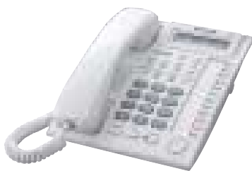
■ KX-T7730 LCD, Speakerphone Unit

Please contact your dealer or phone company to confirm if the Caller ID service is available in your area.