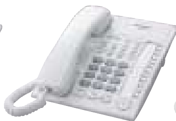
■ KX-T7720 Speakerphone Unit