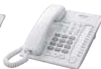
■ KX-T7750 Monitor Unit