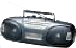
Music on Hold