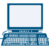
Access to PC