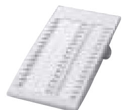
■ KX-T7740 DSS Console