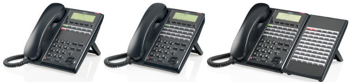
TDM Handsets: Easy call control from the office

Discover more: > SL2100 Communications System (Info Sheet)