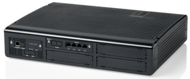
SL2100 Communication Server: Scalable from 1 to 128 users