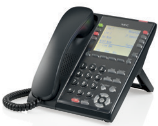
IP Handset: Easy call control from the office, remote office or home office